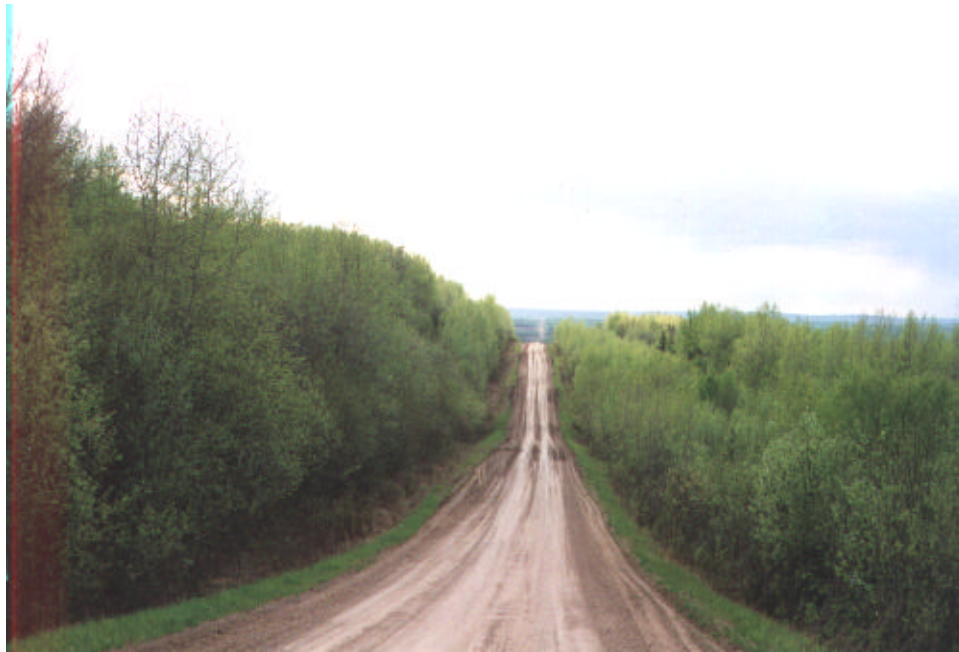
Northern Alberta boreal-forest road leading westward from Dixonville into the Whitemud River area and the location I would be for 2 days (02 to 04 June 1996).