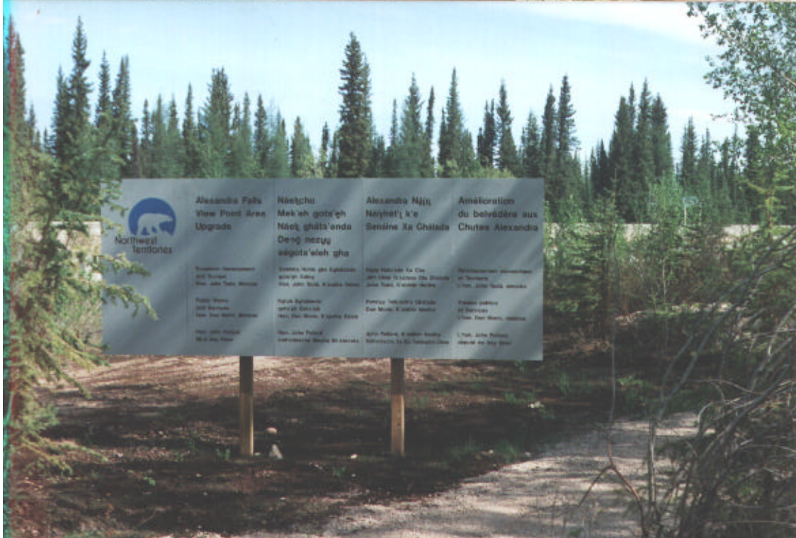
The awesome, northward-flowing Hay River at Alexandria Falls, Northwest Territories at 61 degrees north latitude. I continued northward from Alberta into the NWT between 04 and 06 June 1996. It was too light to see any aurora at night, -- there was even a red glow of the midnight sun which was only about 6 degrees below the horizon at midnight during my stay in the NWT.