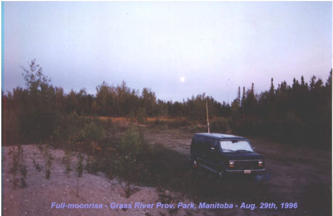
Full-moonrise - Grass River Prov. Park, Manitoba - Aug. 29th, 1996

These two weeks right in the auroral-zone were awesome! When I arrived on 22 August 1996 to this central Manitoba location deep within the Canadian boreal forest, there was a moderate magnetic-storm in progress and the auroral Borealis (Northern Lights) appeared over the entire sky the first and second nights of my stay. Despite declining magnetic disturbances until the 29th of August and a waxing moon - soon to be full on the night of the 28th, the auroral never failed to dazzle me with hours of truly beautiful sights in the nighttime skies, sometimes just a faint arch to the north but often breaking out into lovely forms: swirls, pillars, and curtain. A memorable two weeks! late August has about 5 to 6 hours of total darkness at latitude 54 north in Manitoba, and the aurora is plainly visible each night!