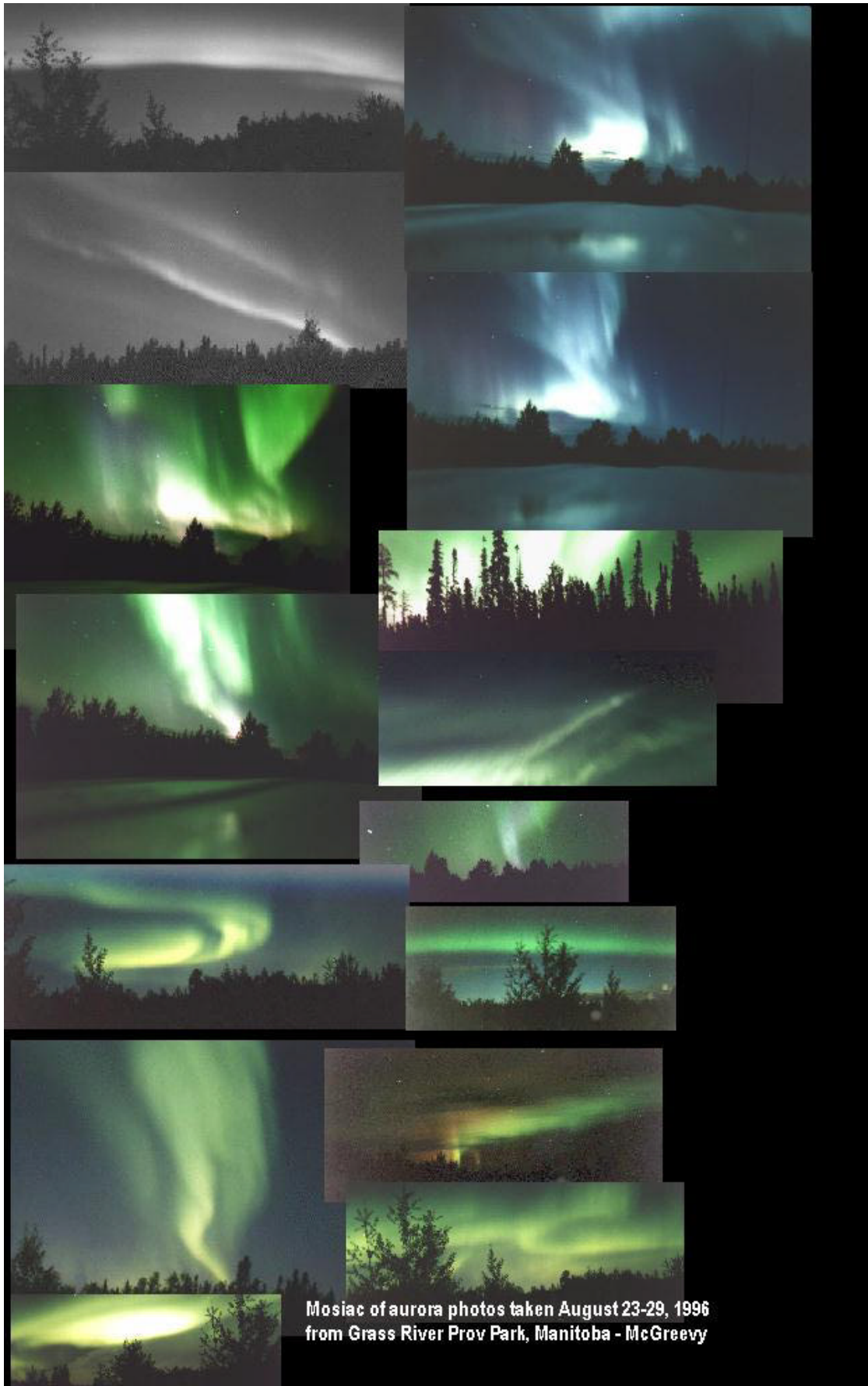
Mosaic of aurora photos taken August 23-29, 1996 from Grass River Prov Park, Manitoba