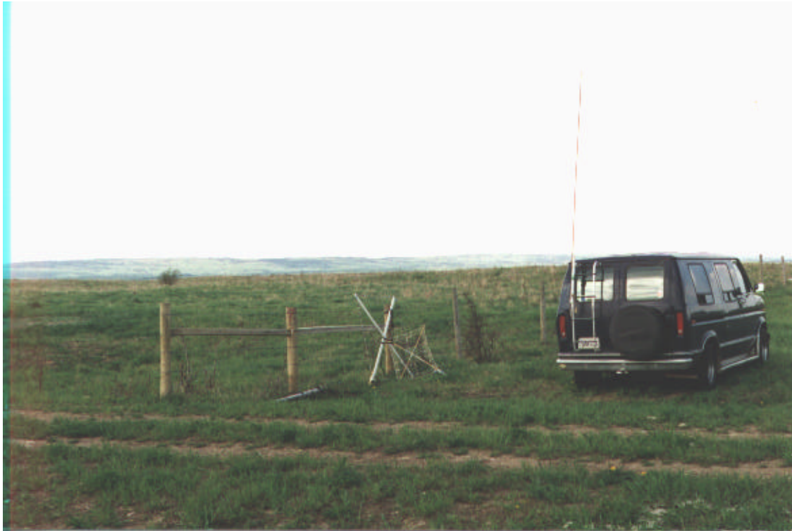
Three-meter (10 ft.) tall copper-pipe vertical antenna used to record tracks 1 to 5