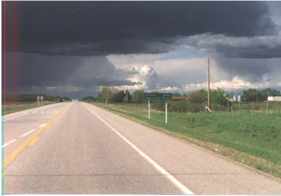
Northbound on Alberta Highway 39 south of Viking, Alberta, 31 May 1996. Huge cumulonimbus clouds were building up each day across the province sparking big lightning storms and associated natural VLF radio phenomena.